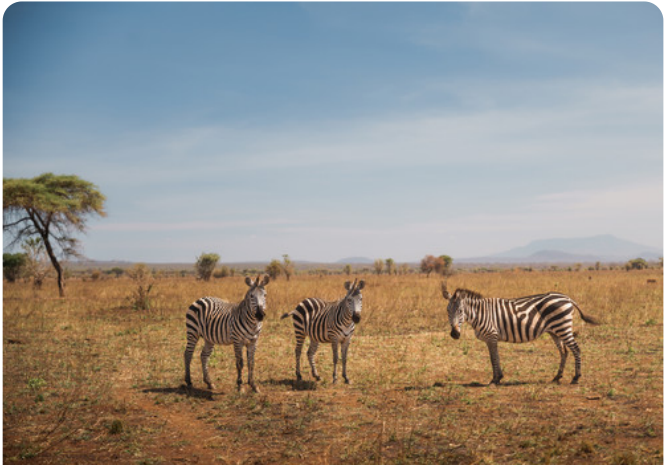
Tarangire National Park

We think you'll be impressed with Tarangire National Park. Most visitors love the distinct shapes of the baobab trees silhouetted against the sky that make this place feel like a fairy-tale African landscape. Or visitors remember the elephants that roam in family bands everywhere throughout the park. If you're lucky, you'll also encounter the big cats – lions especially, but also cheetahs and leopards – that are always a possibility here. And there's a fair degree of certainty that you will tick wildebeest, giraffe, hippo, buffalo and zebra off your wildlife-viewing list.