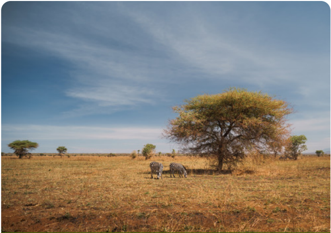
Tarangire National Park