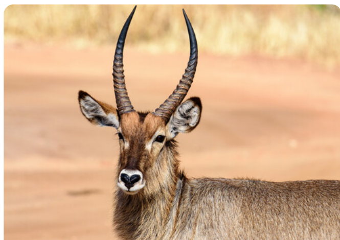
Tarangire National Park